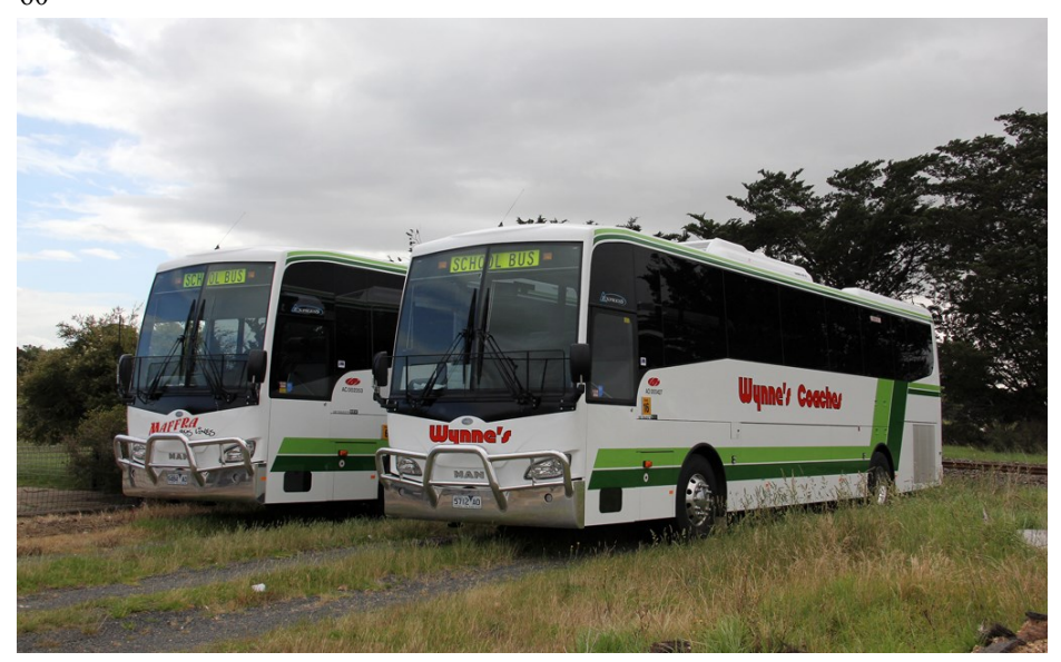
ABOVE related operators Wynne's of Maffra 5712 AO and Maffra Bus Lines 9484 AO a pair of 2013 MAN 18.360/Express school buses on layover in Sale. (Jason Lipszyc).

BELOW: Stonestreet, Toowoomba 422 SMY a 2012 Volvo B13R/Irizar i6 is seen at Coonabarabran on 30/12/12 working empty to Canberra to pick up a load of scouts for the national Jamboree at Maryborough Qld. (Hayden Ramsdale)